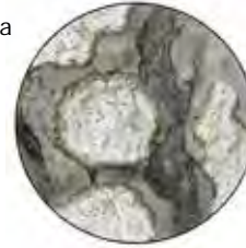
Lecanographa amylacea