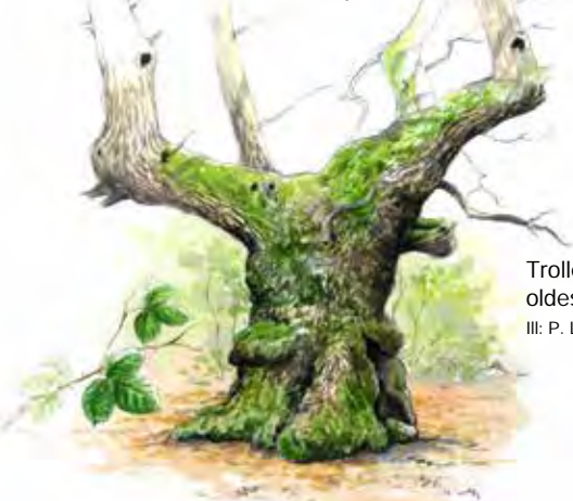
Trolleken – one of the oldest oaks on Ölands. Ill: P. Larsson

The pine forest is dotted with around 30 old, large oaks. The largest is called Trolleken (Troll Oak), one of the oldest oaks on Öland. As many as 155 different lichens have been found growing on the oaks. Many of them are rare. Take a closer look at the rough bark on the oaks and discover the variation in colour and shape of the lichens!