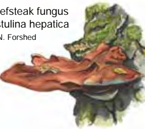
Beefsteak fungus Fistulina hepatica Ill: N. Forshed