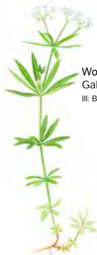
Woodruff Galium odoratum Ill: B. Mossberg