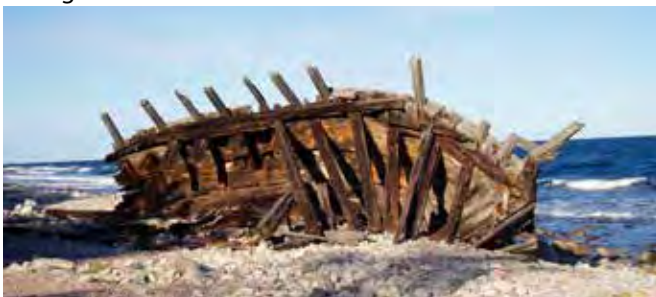
Wreck of the schooner Swiks.

In the 15th century, Örboviken (now Grankullaviken) was a major naval base commanding a large part of the Central Baltic. Traces of the two entrenchments (eastern and western redoubts) which defended the base are still visible. There is also a stone wall dating back to the 16th century, which probably enclosed a hunting park. On the shore is the wreck of the schooner Swiks, which ran ashore here during a storm in December 1926.